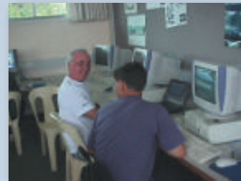
NUI members in New Zealand and South Australia enjoy hands-on workshops.