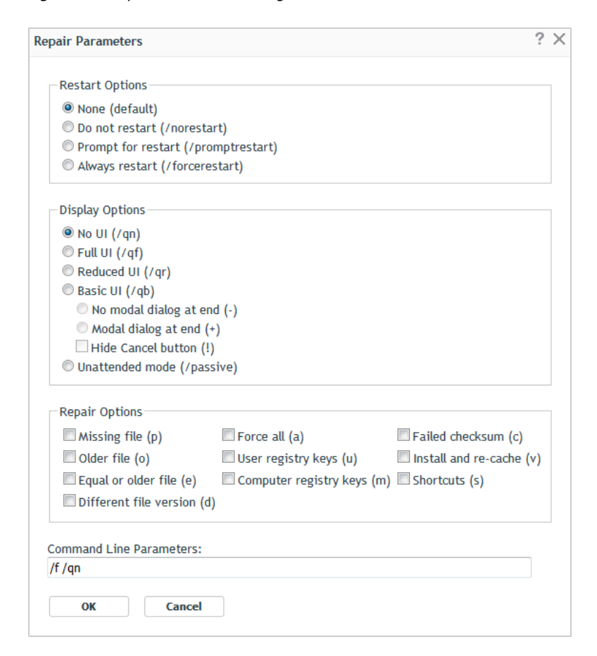
Figure A-2 Repair Parameters Dialog Box

The following sections contain additional information: