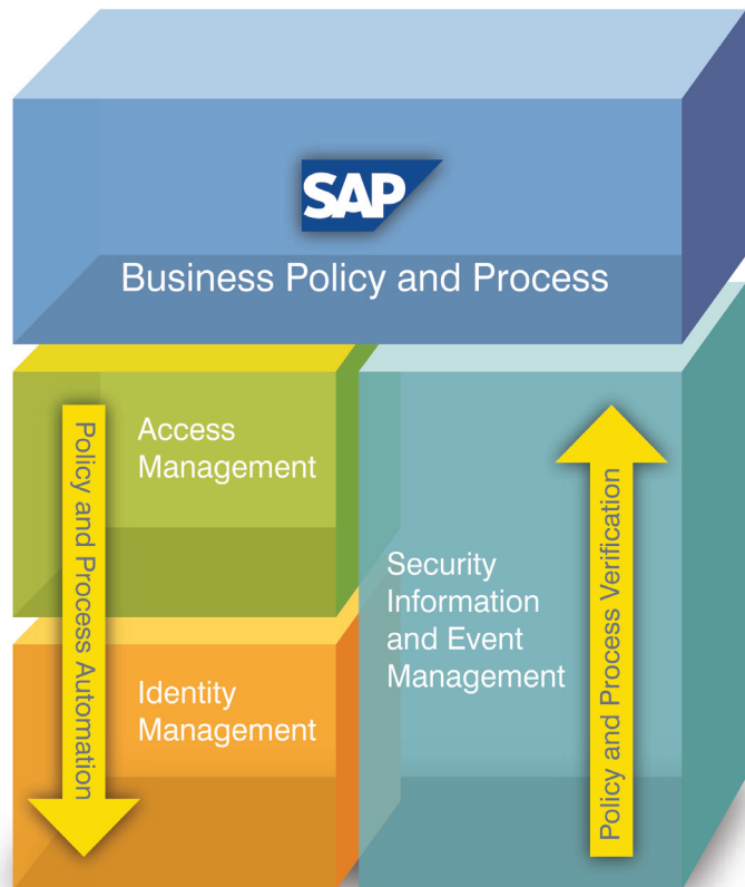
Figure 1. Extends roles provisioning between SAP and other IT systems