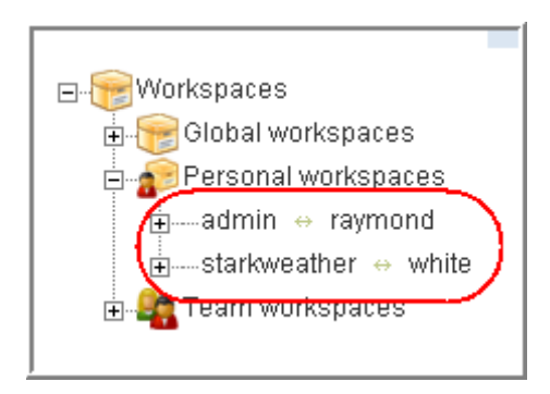
Figure 1-3 Pages as they Appear in the UI

The /ssf/web/docroot/WEB-INF/classes/config/ssf.properties file contains a property called wsTree.maxBucketSize, which, by default, is set to 25. This means that the maximum number of subworkspaces or subfolders allowed is 25. If a folder or workspace has more