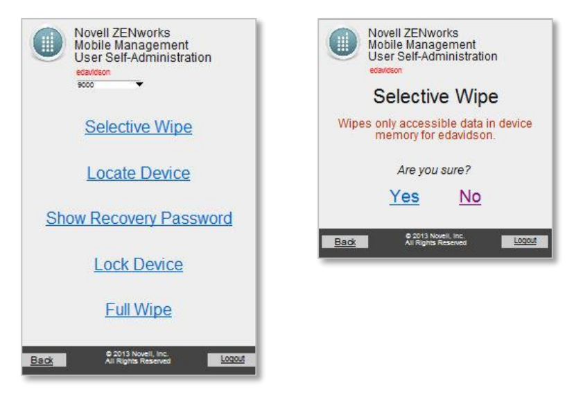
Sample Mobile User Self-Administrative Portal views for an iOS User

Only the options supported by or available for your device platform will appear in the portal menu.