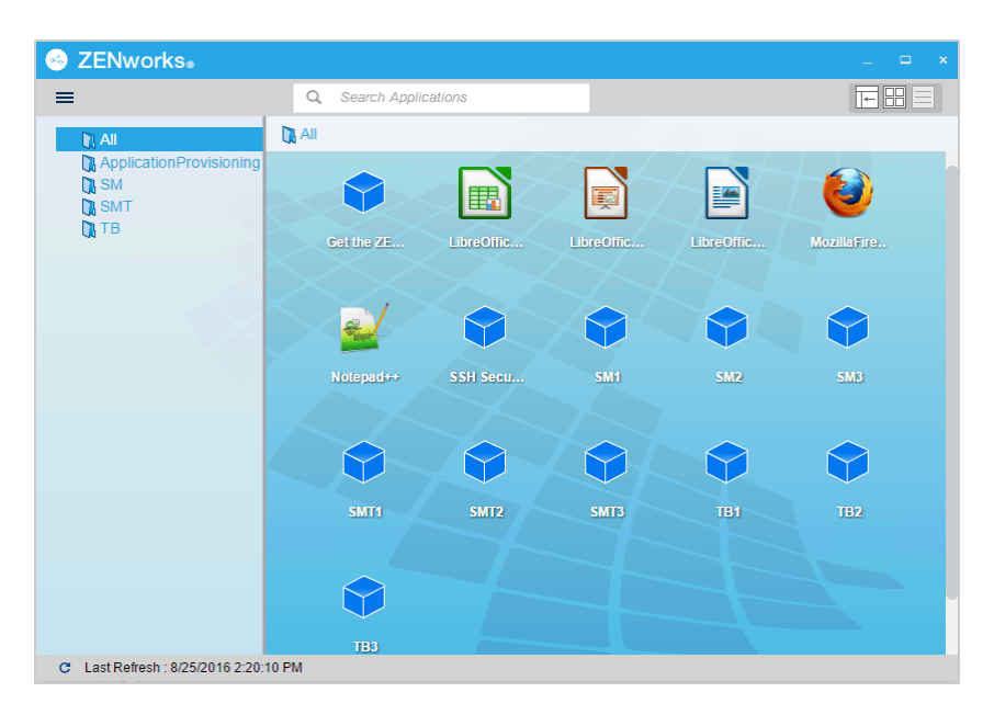
Figure 14-2 Bundles Displayed on the Desktop