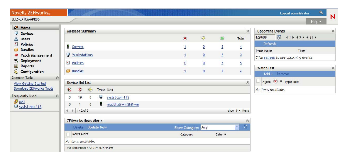
Figure 1-2 ZENworks Control Center

You administer the ZENworks system at the Management Zone level through ZENworks Control Center (ZCC), a task-based Web browser console. The following graphic shows the ZCC portion of the Web browser display: